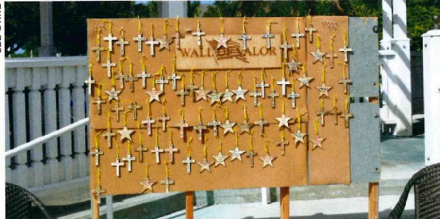
The Wall of Valor represents local Gold Star Mothers' sons and daughters who died while serving in the U.S. armed forces.