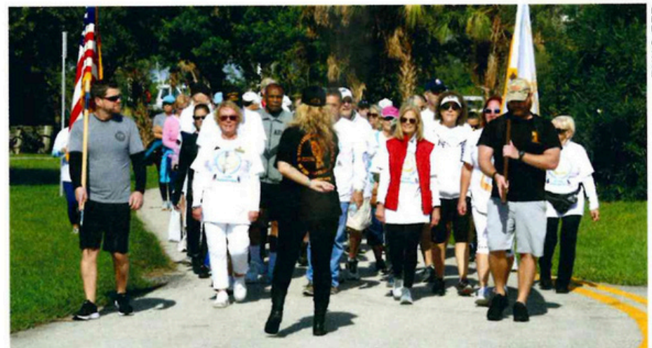
The walk gets underway.